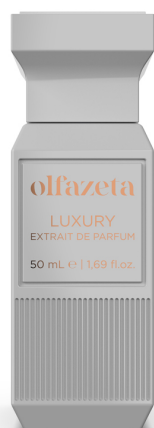
PHOTO OF THE PRODUCT