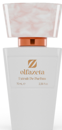
PHOTO OF THE PRODUCT