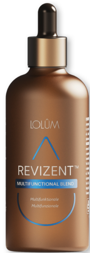
PHOTO OF THE PRODUCT