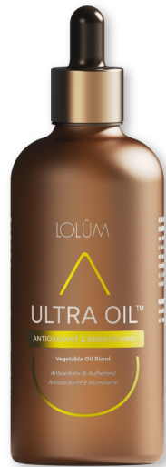
PHOTO OF THE PRODUCT