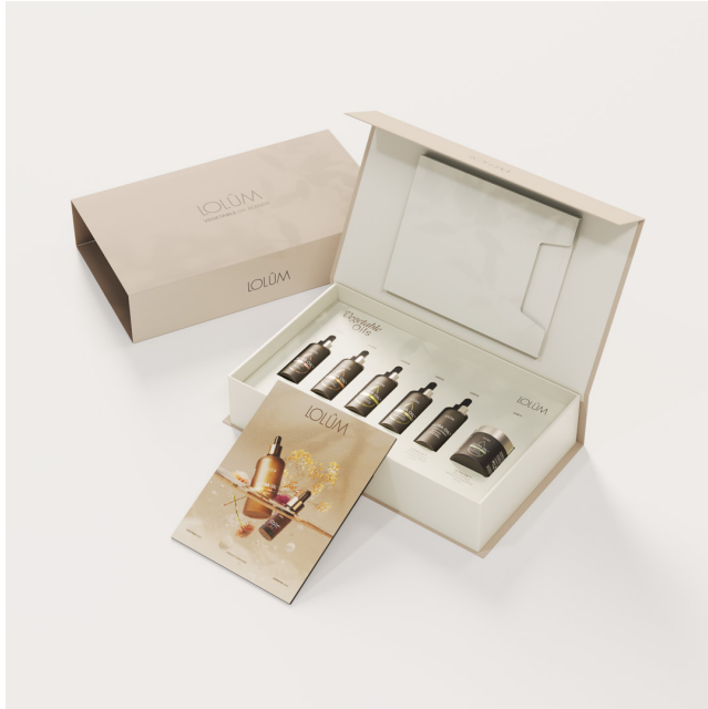
PHOTO OF THE PRODUCT