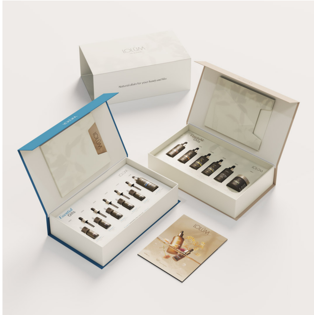
PHOTO OF THE PRODUCT