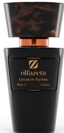
PHOTO OF THE PRODUCT