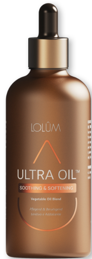
PHOTO OF THE PRODUCT